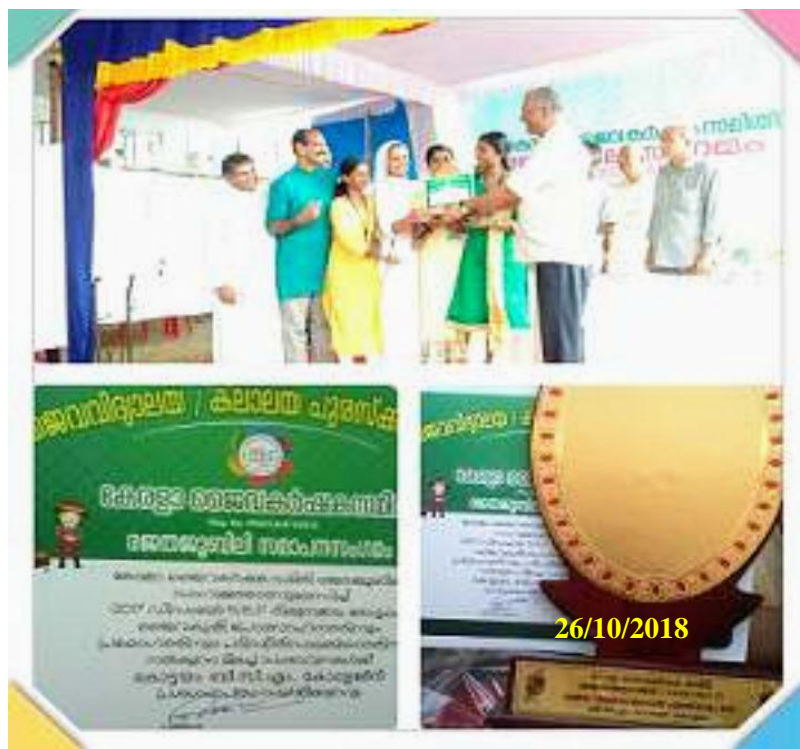
Bishop Chulaparambil Memorial College students receiving the Kerala Jaiva Karshaka Samithi Award 26 th October 2018

A 25-year-old organic farmers group, Kerala Jaiva Karshaka Samithi, has won global recognition for their determined efforts in innovating organic farming on 26 th October 2018. The students of Bishop Chulaparambil Memorial College was awarded 'Kerala Jaiva Karshaka Samithi Award' for the best college for organic farming in kottayam. They had rewarded this award for their devoted participation. This helped the students to be a role model to others in showing the way to plant organic vegetables. 58 students participated in the programme.