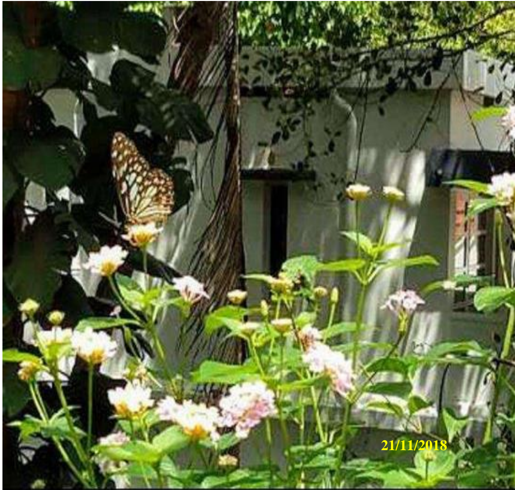
Bishop Chulaparambil Memorial College 's butterfly garden on 21 st November 2018