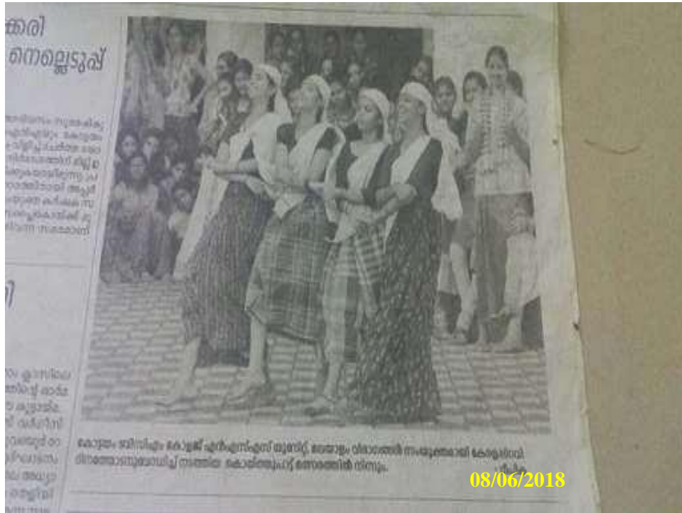
Bishop Chulaparambil Memorial College students singing “KOITHUPATTU” at college on 8 th June 2018