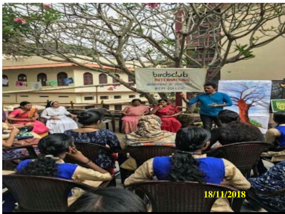
The bird club international seminar section for the students of Bishop Chulaparambil Memorial College on 18 th November 2018

They keep the climate stable, oxygenate air and transform pollutants into nutrients. Birds play an important role in the effective functioning of these systems. As birds are high up in the food chain, they are also good indicators of the general state of our biodiversity. The Bird Club International conducted a seminar session for the students of Bishop Chulaparambil Memorial College on 18 th November 2018. The students actively participated in this. The seminar helped the students to know about birds and the way in protecting them. It was a good experience for every student. In the programme 63 students were participated.