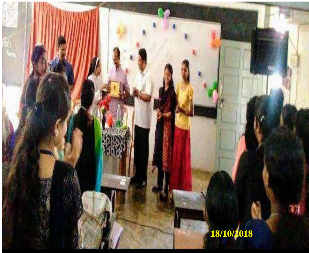
Memento distribution for the coordinator of the seminar on 18 th October 2018

On 18 th October 2018 College conducted a seminar on 'Climate change and Disaster Risk Reduction'. Disaster management is important because it aims to ensure an effective and coordinated response to disasters. Through work to save lives and reduce the impact of crises on affected communities, disaster management is fundamental to timely and effectual assistance to disaster hit people. Students of Bishop Chulaparambil Memorial College were activated in the production for reducing the disaster based on climate change. Majority of the students acted as volunteers also. The seminar made the students to know more about climate change and disaster risk reduction. In the programme 76 students participated.