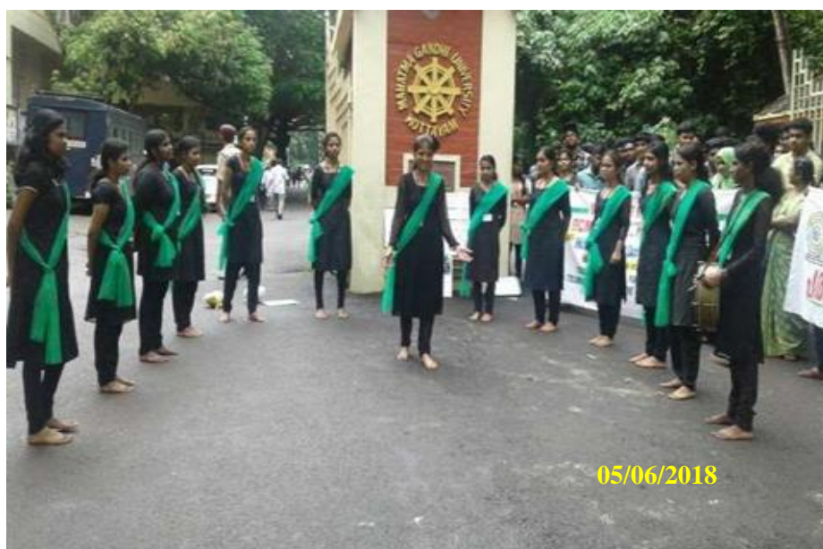
Students performing street play at Mahatma Gandhi University 5th June 2018