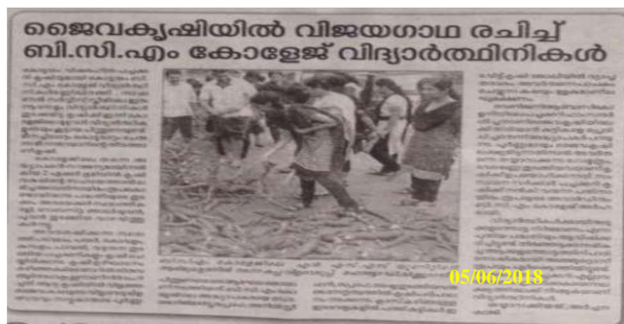
Bishop Chulaparambil Memorial College students harvesting tapioca news in media on 5th June 2018

Organic farming reduces human and animal health hazards by reducing the level of residues in the product. It helps in keeping agricultural production at a sustainable level. It reduces the cost of agricultural production and also improves the soil health. The “Jaivam” programme was conducted on 5th June 2018, by the Bishop Chulaparambil Memorial College students in order to raise the importance of organic farming. It involved the use of biological materials, avoided synthetic substances to maintain soil fertility and ecological balance thereby minimizing pollution and waste. 25 students participated in the programme.