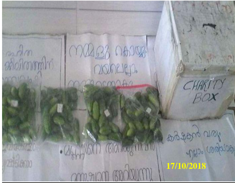
Bishop Chulaparambil Memorial College students displaying Gourd on 17 th October 2018