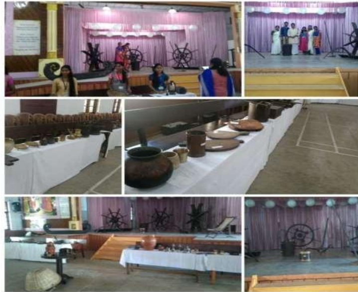
BMC students exhibition on agriculture equipments and utensils on 1 st November 2018