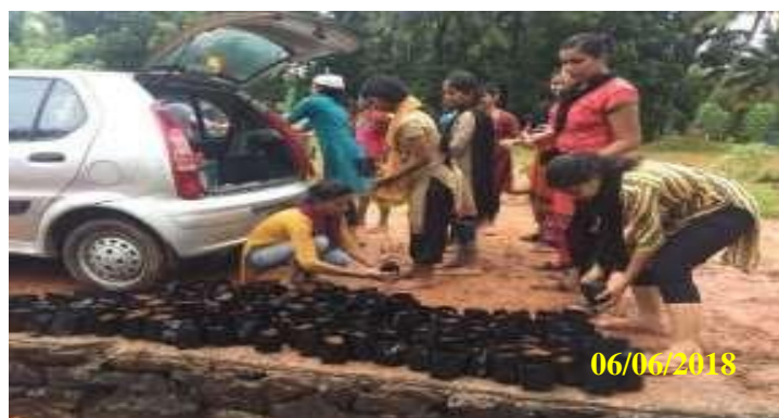
Bishop Chulaparambil Memorial College students supplying of tender plants on 6 th June 2018

The environment depends on plants to prevent soil erosion, to assist in the nitrogen cycle, and to be part of the water cycle. It is vital that plants thrive so that humans can survive. This is why plant conservation is so important. The student's actively participated in supplying the tender plants on 6 th June 2018. They worked together for bringing a hand in combating environmental degradation by promoting the need of planting trees and conserving the ecosystem. 32 students participated in the programme.