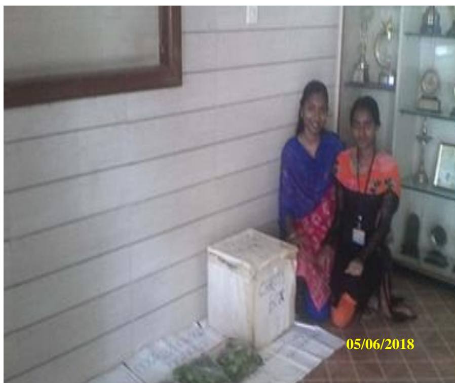
Sale and Preparation of Koval seeds on 5th June 2018