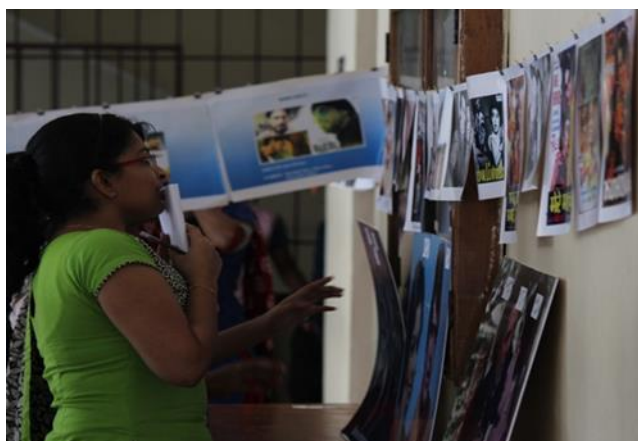
Hindi Munch Programmes