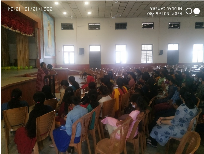
Orientation programme on 13.12.2021