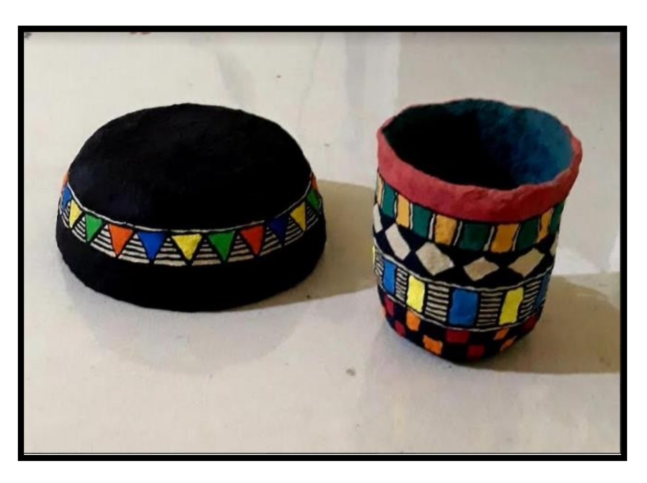
Madhubani in Clay! (2019-20)