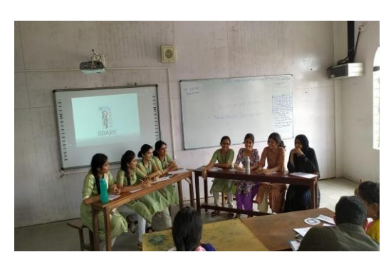
DAY 4:HR INTERVIEW

DAY 3: COMMUNICATIVE AND TECHNICAL SKILL TEST