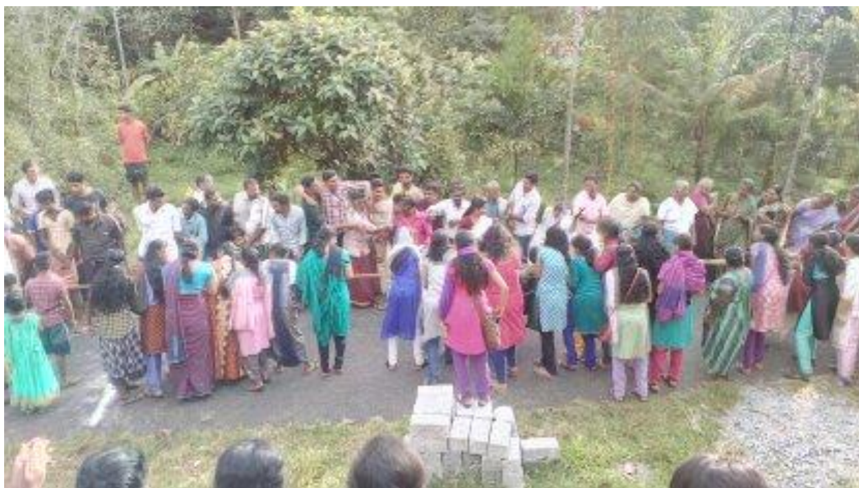
NSS Volunteers participating with the inhabitants of the area in the “Tug of War”.