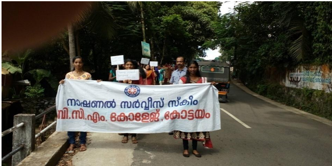
NSS Volunteers participating in the rally on “World Heart Day”