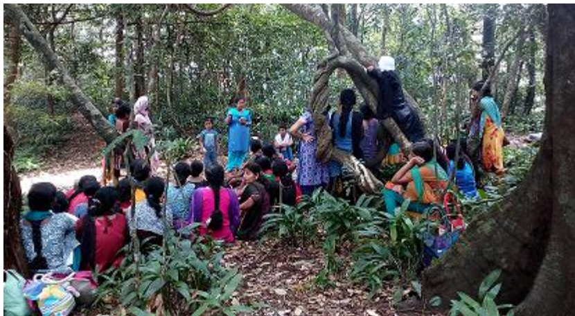
Class on the need for energy conservation being taken in a forest to show students about the difference