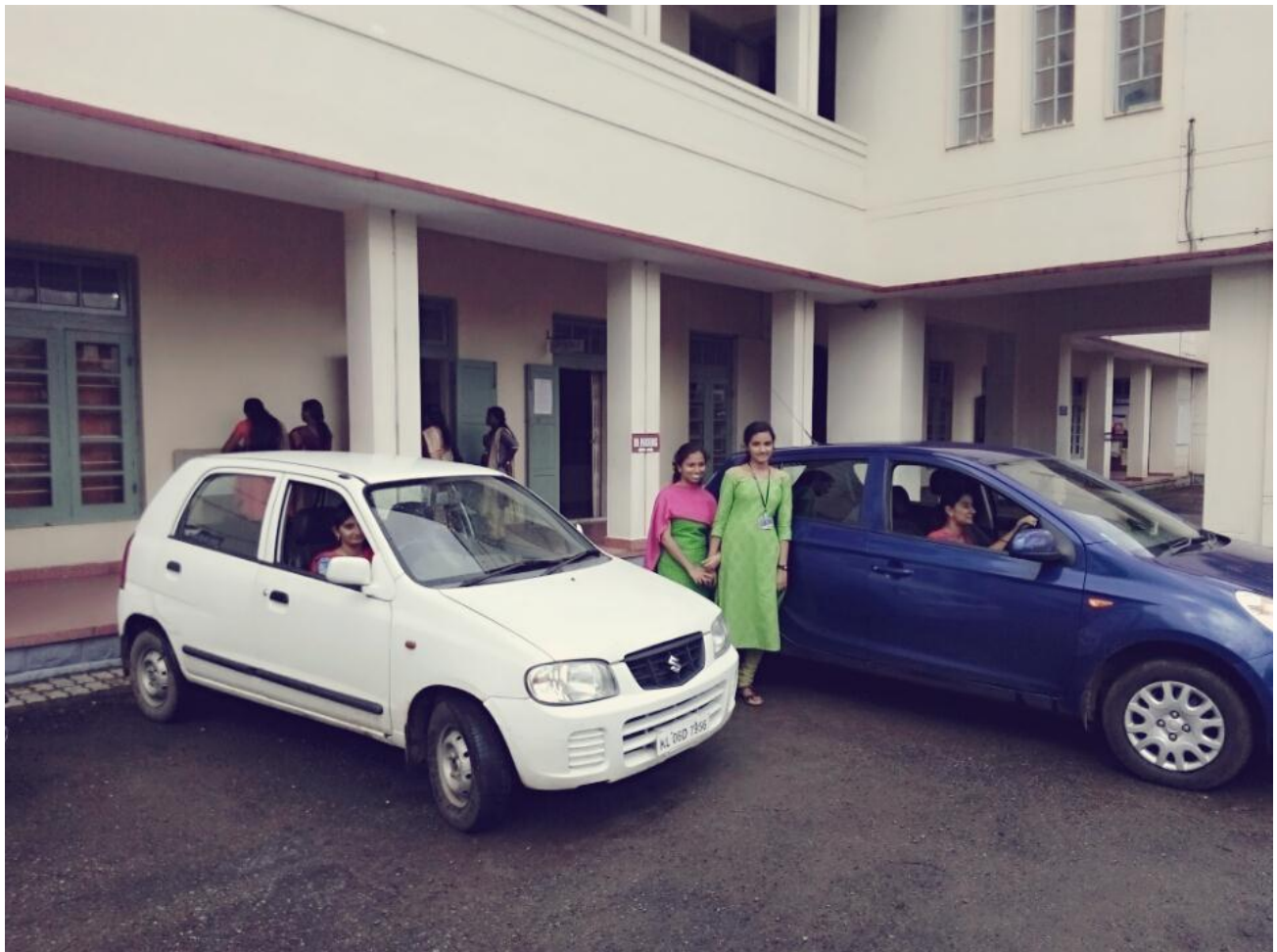
Students who learned Driving with their cars in BCM College

NSS Unit of BCM College arranged facilities for students to learn driving at subsidized rates. This was done in Association with Popular Driving school. 50 students have enrolled and paid fees to learn driving from Popular under the guidance of BCM NSS Unit. This was with the intention of supporting them with an additional livelihood option.