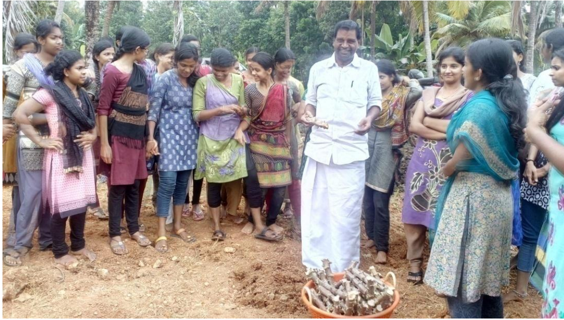
Shri. Thiruvanchoor Radhakrishnan, Honourable Minister and MLA of Kottayam Inaugurating our “Organic Farming”