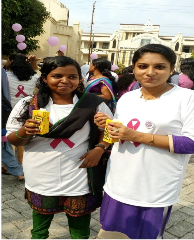
NSS Volunteers of BCM College after the rally “ PINKATHON” to spread Breast Cancer Awareness”