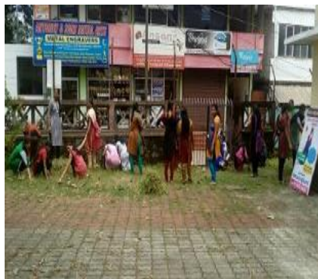
NSS Volunteers and teachers cleaning the premises of DDE Office& Pakal Veedu