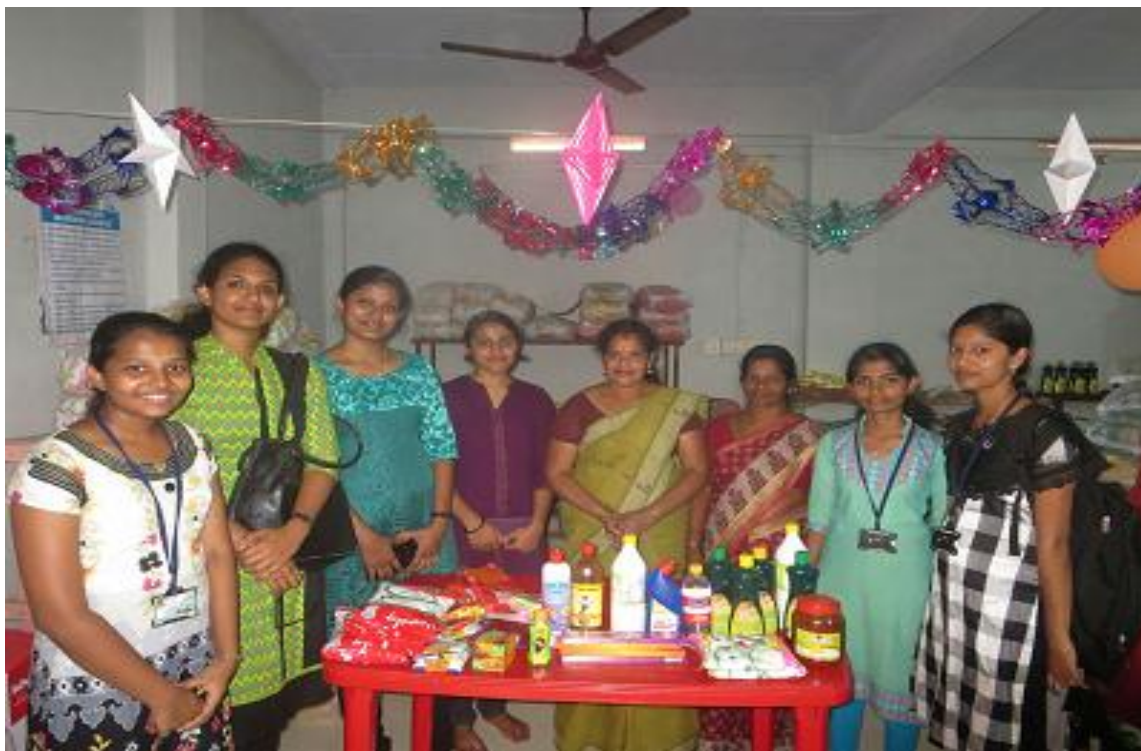
Our Students with the SHG members they supported in marketing

. Marketing of products purchased from the SHG's was done by the students in order to help the SHG members. This activity provided the students an opportunity to try out the marketing tactics, that they have learned through commerce text books . Developing of social interaction skills of the students was the hidden agenda of the programme and the programme was a success in achieving its target.