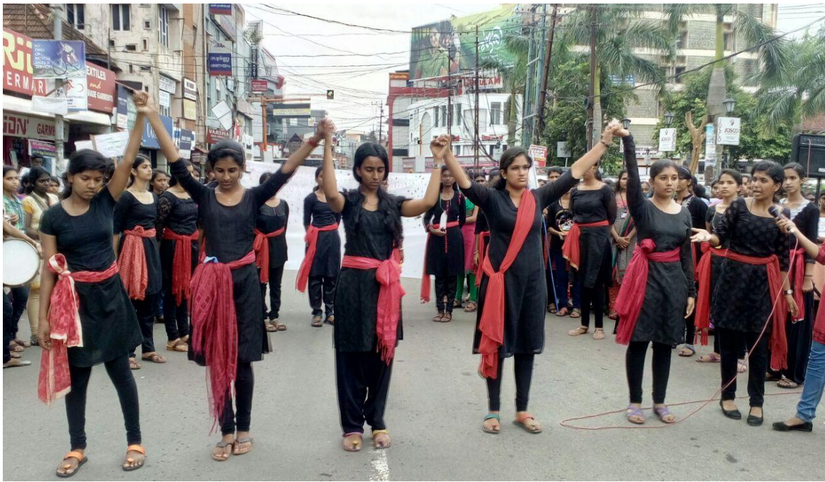
Students performing in the Street Play against Drug Usage.