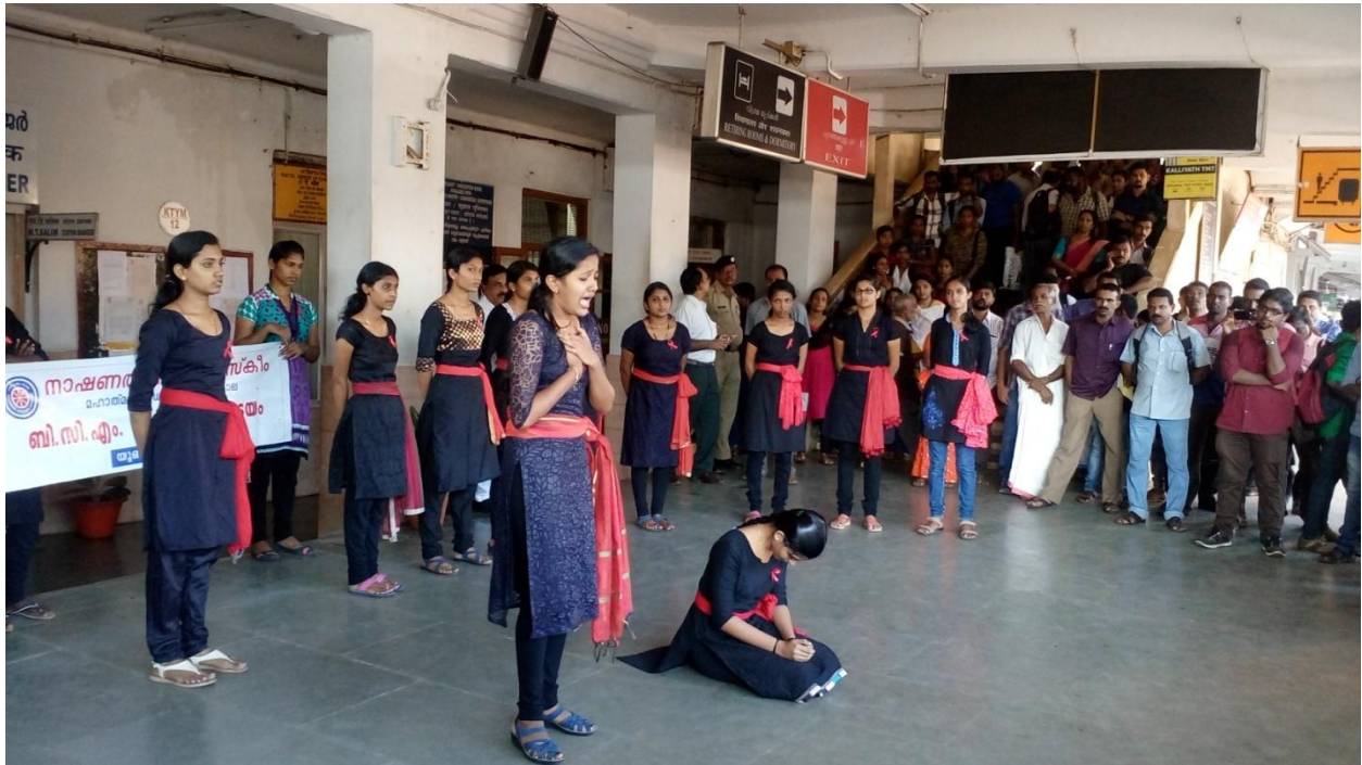
A Scene from the street play against Aids done by NSS Volunteers of BCM College CHENNAIK ORU KAITHANGU”