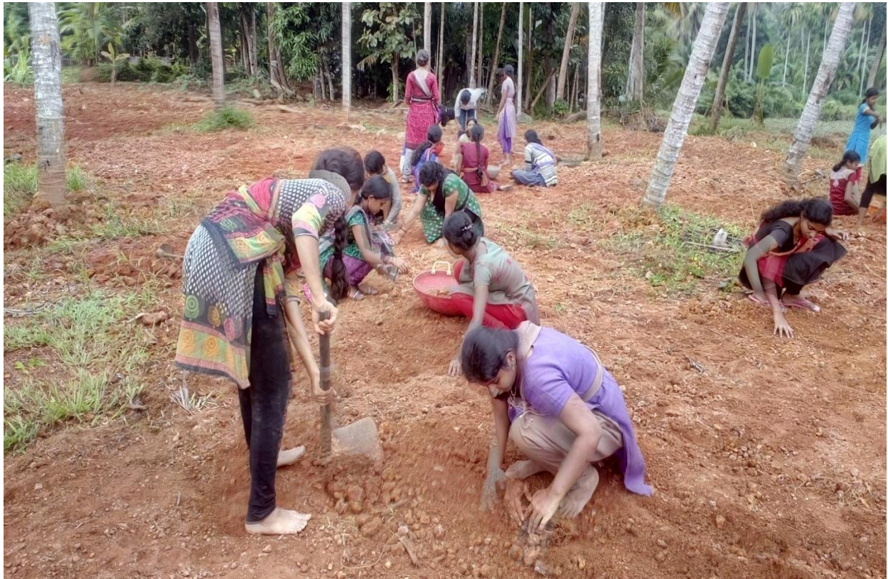
NSS Volunteers engaged in land preparations

Government of Kerala for being the best performing institution in Kottayam .