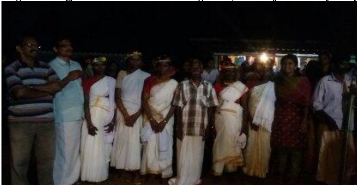
Local people of Pattayakudi In their traditional dress after performing Koothu.