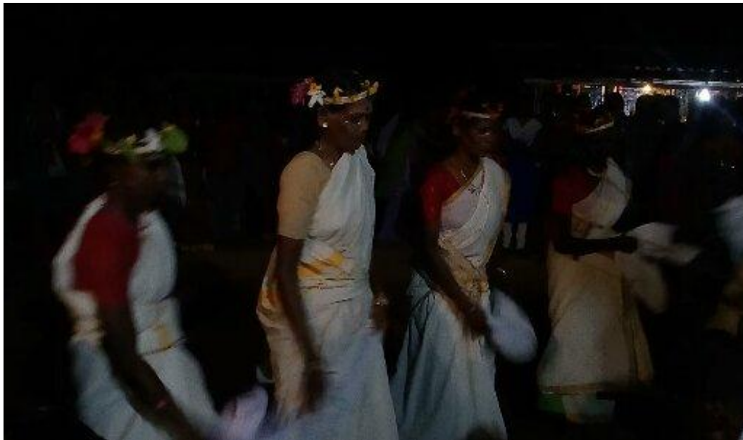
Adivasi's performing Koothu As part of Cultural Exchange