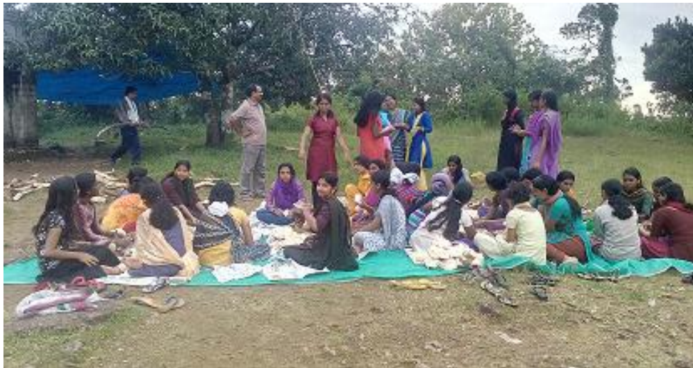
‘Chakka Puzhukku maholsavam’ students getting the jackfruit ready as a team