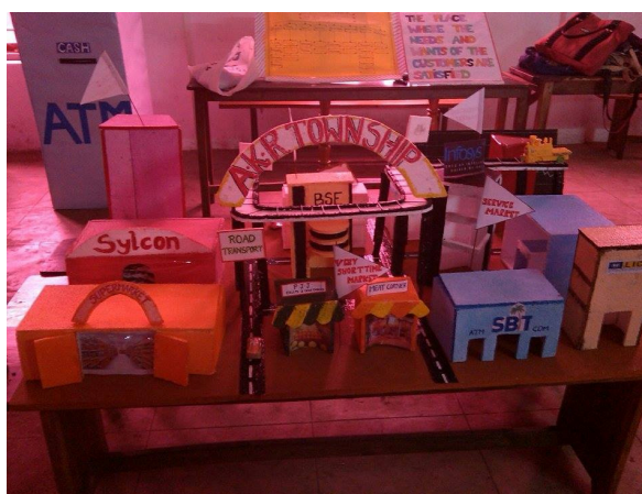
Various models related to Commerce and Management being depicted in VAJRA