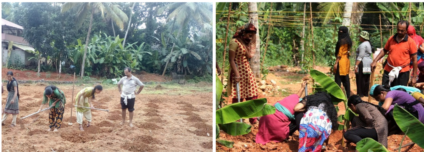
Students engaged in agricultural activities