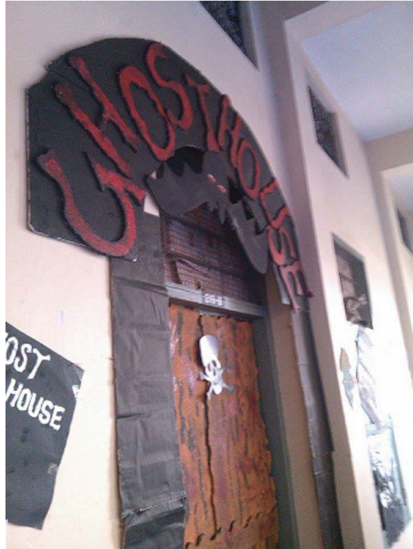
Door leading Into the Ghost House created by students during VAJRA EXPO