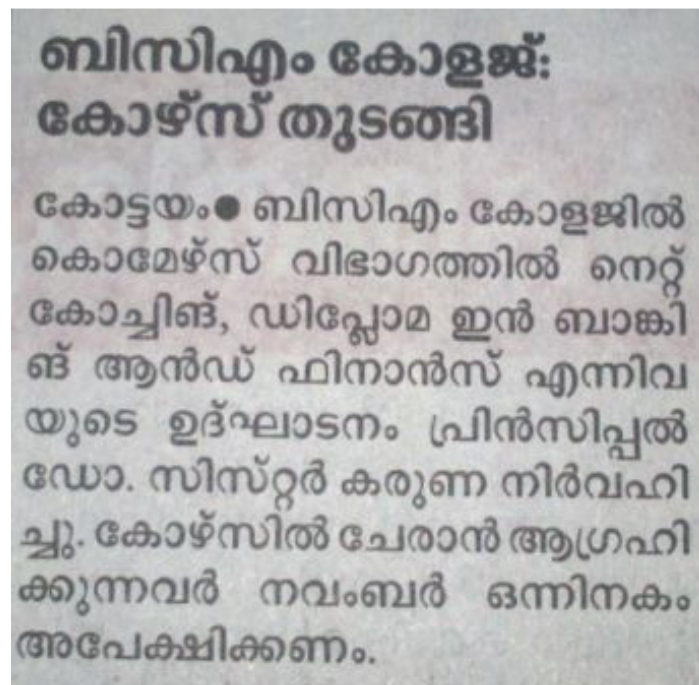
Malayala Manorama - 16.10.2014

scale retirement of personnel. Banking and finance industry will require professionally qualified manpower endowed with banking and finance knowledge and skills together with technology-familiarity, customer-orientation and hands-on application skills who can be assigned to various desks / jobs with minimal training intervention at the bank level.