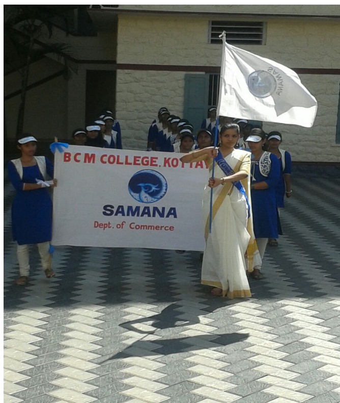
Students of SAMANA during the March Past Competition for PC Lucy Memorial Ever rolling trophy