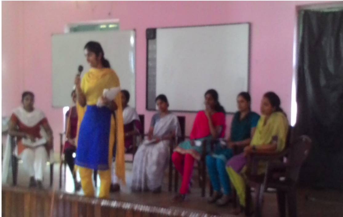
Students participating in Group Discussion ( Top) The judges and audience of Gropu Discussion (Bottom)